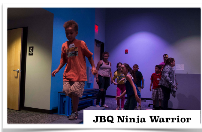
JBQ Ninja Warrior

2. Slow the pace down. Remind your quizzers to slow down, not just with the buzzers, but also with their study. Slowing the pace will actually give them opportunities to study the Scriptures and have a better understanding of what they are learning (not just cramming their