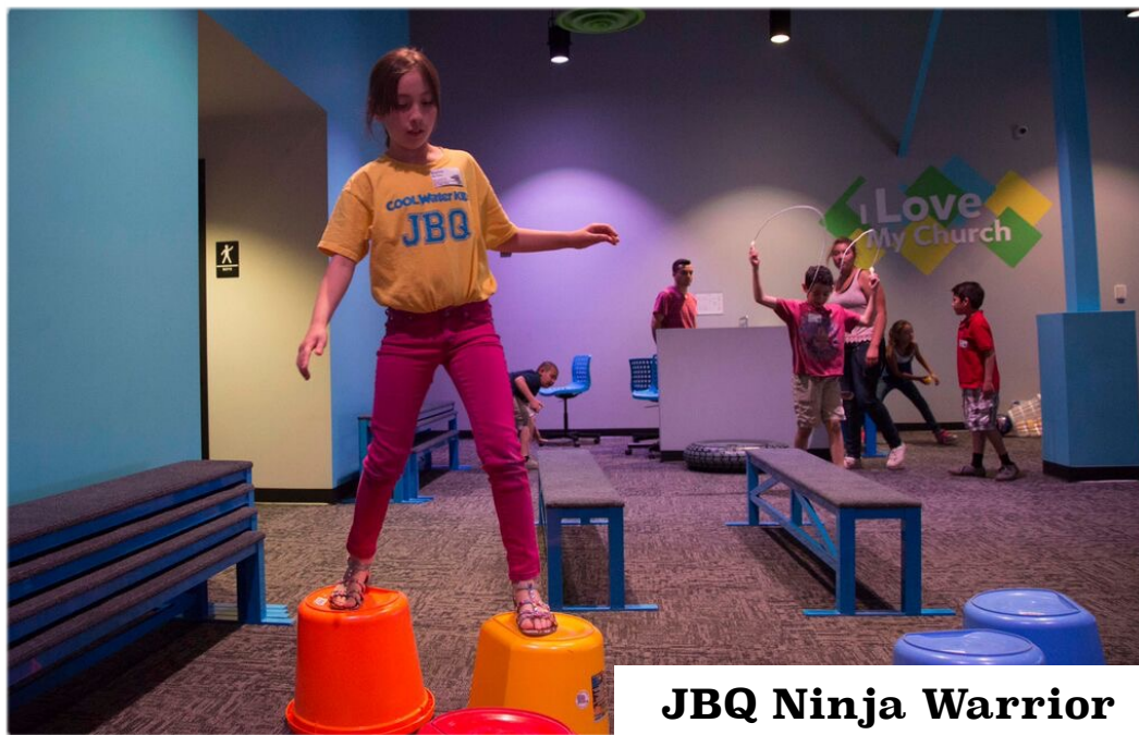
JBQ Ninja Warrior